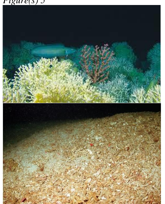
The top Oculina coral reef is undisturbed. Trawling has devastated the one below, located at Oculina Banks off the coast of Florida. Only about 10 percent of Oculina habitat remains intact.

years of climate change, tectonic shifts and other global events through evolution, only to be destroyed by massive metal weights being dragged behind the boats of such fishermen (See figure 5). John Pickrell, from National Geographic, reported on the subject concerning actions being taken by the United Nations, "Concerned that many species may be lost before they are identified, a group of 1,136 scientists from 69 countries is (are) appealing for new laws to protect deep-ocean corals and sponges... 'We urge the United Nations and appropriate