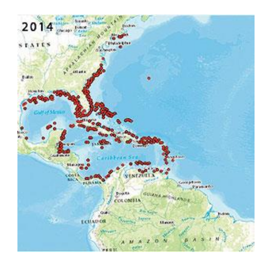
Encyclopedia of Modern Coral Reefs: Structure, Form and Process