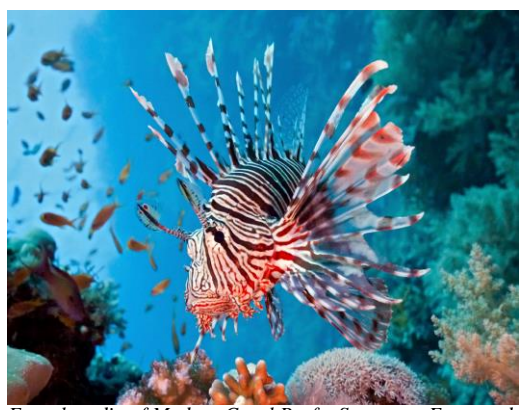
Encyclopedia of Modern Coral Reefs: Structure, Form and

The rising populations of lionfish within the keys and gulf coast regions of Florida continue to mar the fragile reefs in the region: In order to combat this invasive species a number of organizations have begun to raise awareness for the issue through competitions and